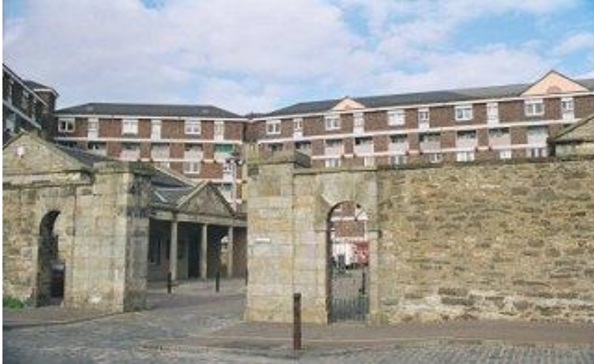
Gate house and wall of old Leith Fort 2012